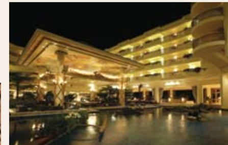
Voted No. 1 Hotel Spa, World's Best Award Travel + Leisure, 2008