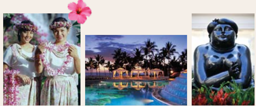
Four Diamond Award Recipient, AAA, 2003 - 2008

Discover the endless possibilities for creating memories to last a lifetime at Grand Wailea.