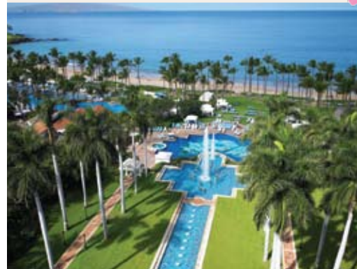
Top 500 Hotels in the World Travel + Leisure, 2010